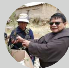
Franciscan Justice and Peace Movement