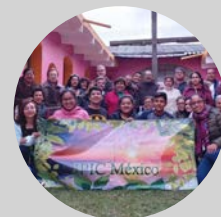
Mexico, JPIC Course