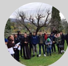
Assisi, Event of 40th Anniversary of St. Francis as Patron Saint of Ecology