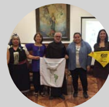
Chile, Franciscan activities for Climate