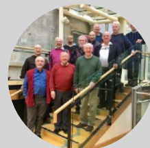
Meeting of JPIC Commission, Ireland