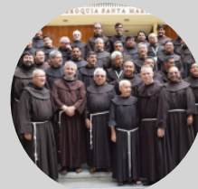
The 25th Meeting of UCLAF