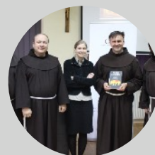
Franciscan Participation in COP24