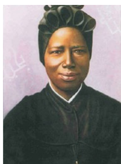
SAINT JOSEPHINE BAKHITA

Born c. 1869 in Olgossa, Darfur, Sudan. Died 8 February 1947, Italy. Year of beatification 1992 (17 May). Year of canonization 2000 (1 October). Feast Day 8 February.