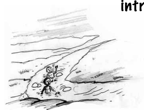
water - pag. 8