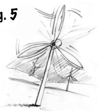
energy - pag. 10